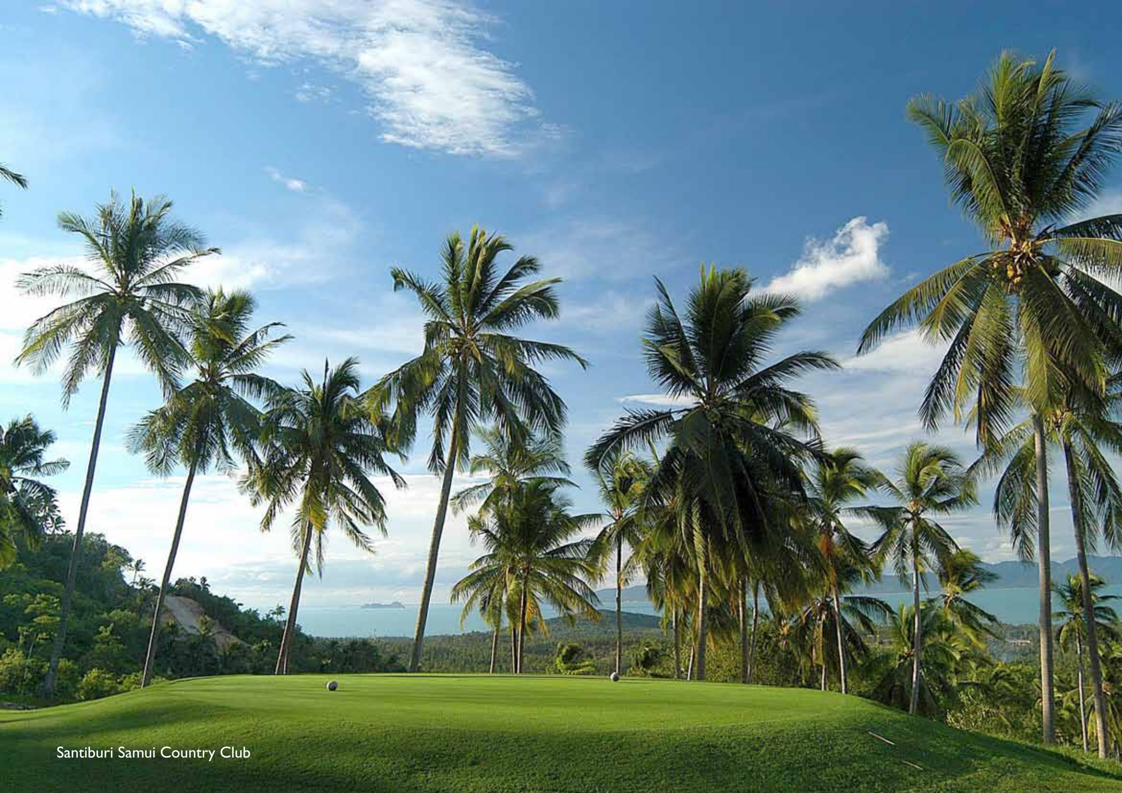
Santiburi Samui Country Club