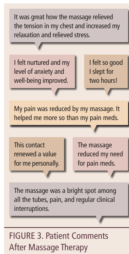
FIGURE 3. Patient Comments After Massage Therapy

This pilot study's results suggest that massage therapy can be integrated successfully into the postoperative care of breast surgery recipients. In addition, nursing staff found benefits in offering massage therapy to their patients. Nursing staff may consider massage therapy as a valuable nonpharmacologic pain manage-